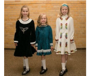
Irish Dancers will be one of the performers at the annual Celtic Festival in Moorhead.

The City of Moorhead Celtic Festival will use grant funds to secure six different musical and performing acts specializing in the arts and activities of Celtic culture for their annual Celtic Festival, to take place Saturday, March 16, 2024 from 10 am to 3 pm at the Hjemkomst Center in Moorhead, MN. Two separate stages will accommodate the variety of artists who will share their talents with the community.