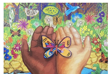
Detail from “Welcome to Pelican Rapids” mural by local elementary students, 2022.