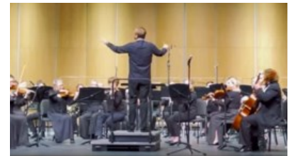
CLSO will partner with local Alexandria students for their “Art and Music” concert in March, 2024.

Central Lakes Symphony Orchestra (CLSO) will use grant funds to empower and educate local Alexandria students in the process of using visual art to inspire music composition, and vice versa, merging music and visual expression. Students will create visual art inspired by the live orchestra, which will be displayed at the Art and Music concert scheduled for March 24, 2024 at 2 pm.