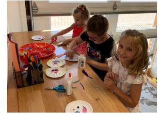
Children creating in the Maker Shop at Otter Cove Children's Museum.