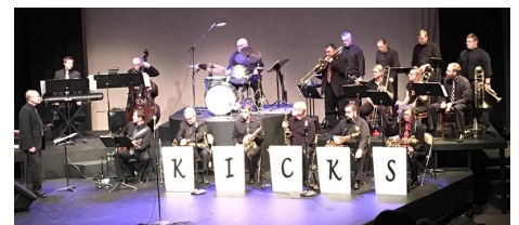
Kicks Band will perform original work at their concert in March, 2024.

Kicks Band of Fargo Moorhead will provide the region access to original musical compositions, and encourage and support the creation of new big band music through the recording of original works created by local composers and an ORIGINALS concert, designed to encourage concertgoers to seek local jazz as part of their variety of music to be held on March 2, 2024.