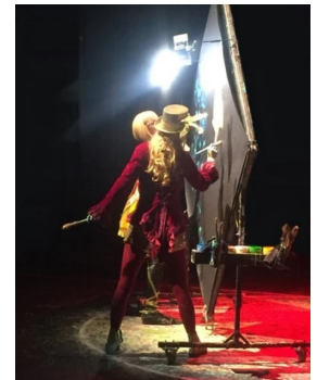
Members of Artrageous create a live visual art piece.

A Center for the Arts will use grant funds to share with their community and patrons the artistic talents of Artrageous, a troupe of multi-talented Live performance artists, world-class singers, and recording artists, highly trained dancers, and audience motivators, and veteran musicians hailing from the high desert of New Mexico. The performance will take place on April 12, 2024.